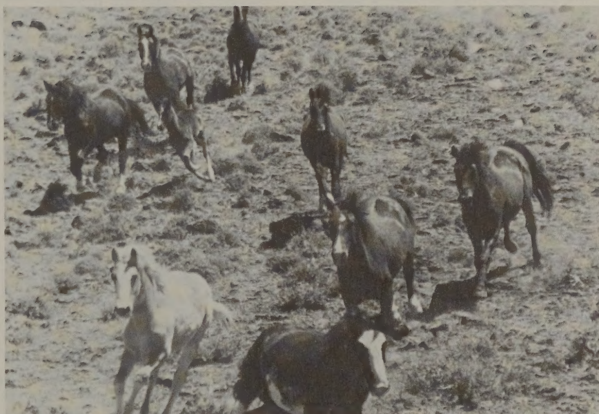
A band of wild horses near Susanville, California, gallops across the range much as its ancestors did in the early 1830's when trapper-explorer Zenas Leonard described the California prairies as "swarming with wild horses."

Yet in the context of history and prehistory, the horses arriving in Mexico were completing a com-